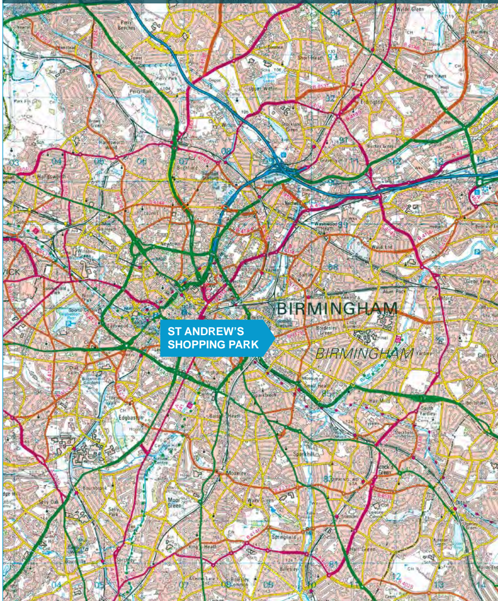
ROAD LOCATION PLAN